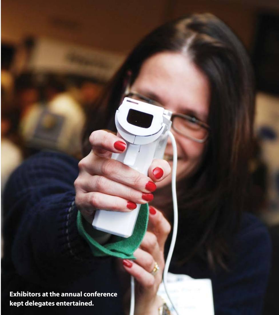
Exhibitors at the annual conference kept delegates entertained.